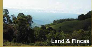
Land & Fincas